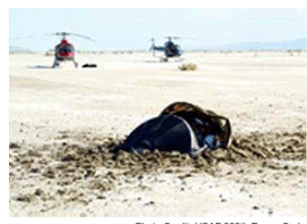
Genesis was recovered in the Utah desert with fears that all data were lost.

them. In a new study published in the American Journal of Ophthalmology , the researchers report oxygen may be the culprit.