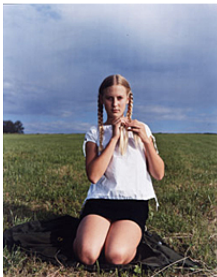
303 Gallery, New York Collier Schorr, Lina, Opening Braid, Bettringen , 2001, part of the Reality Bites exhibition

REALITY BITES: Since the fall of the Berlin Wall, Germany has reemerged as an intellectual and creative center within the international art world. On February 9, the Mildred Lane Kemper Art Museum will open Reality Bites: Making Avant-garde Art in Post-Wall Germany , the first thematic museum exhibition to examine how contemporary artists have dealt with German reunification. The exhibition will remain on view through April 29.