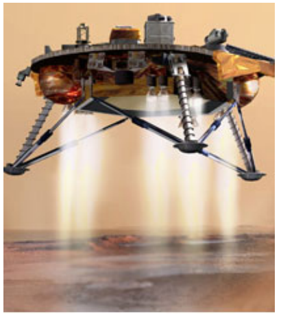
Phoenix Mars Mission space vehicle touched down on its three legs to make a soft landing onto the northern Mars terrain called Green Valley.

jumped into action to determine the cause. Her work sparked an international investigation and a recall of the common blood thinner heparin blamed for deaths and severe reactions worldwide.