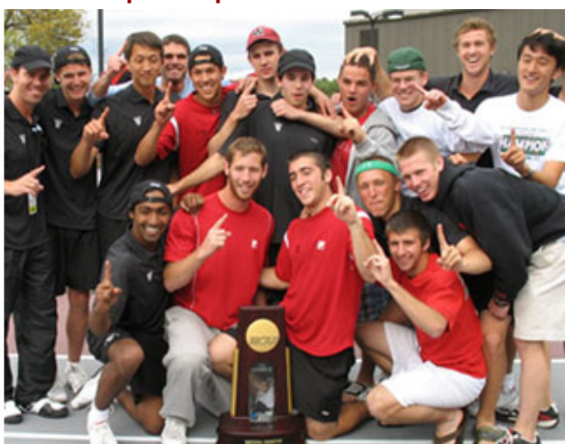
The Washington University Bears topped the Emory Eagles 5-3 to win their first NCAA Division III Championship.